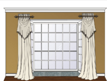
Design Idea 2

Using the large bay window in her living room as the backdrop for my ideas, I sent Anne a few designs based on the things we had talked about in our first meeting. It helped to see the different styles drawn to scale as well as a variety of decorative hardware.