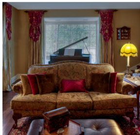
Elegant Living Room